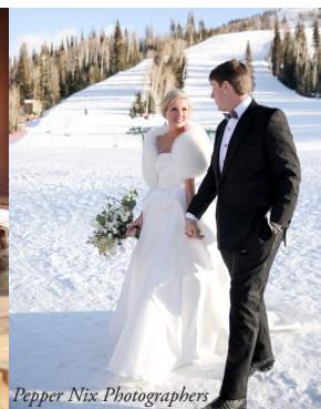
Pepper Nix Photographers