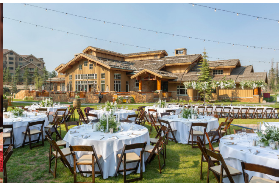
Angela Howard Photography