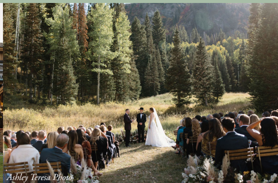
Ashley Teresa Photo