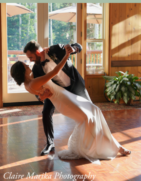
Claire Marika Photography