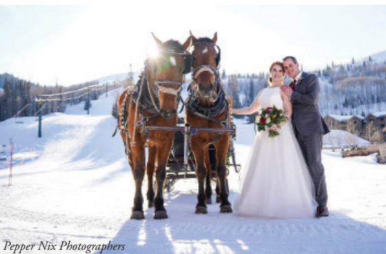
Pepper Nix Photographers